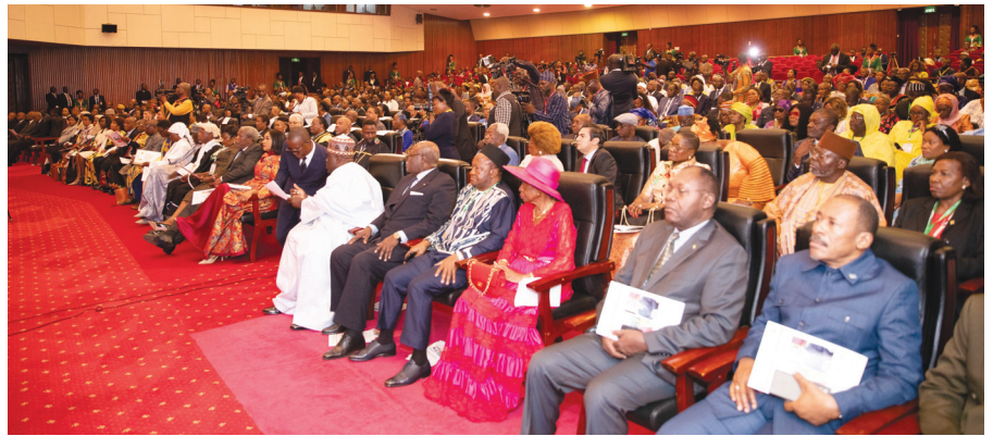
A cross section of delegates at the opening yesterday