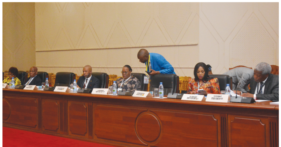
The delegates are working to give in their best for the wellbeing of African people

This explains why delegates have spread themselves into sub-committees in order to focus on soul-searching topics like the role of Parliaments in strengthening openness, transparency and accountability; African Parliaments in the implementation of the African Continental Free Trade Area; addressing the challenges of food security in Africa by