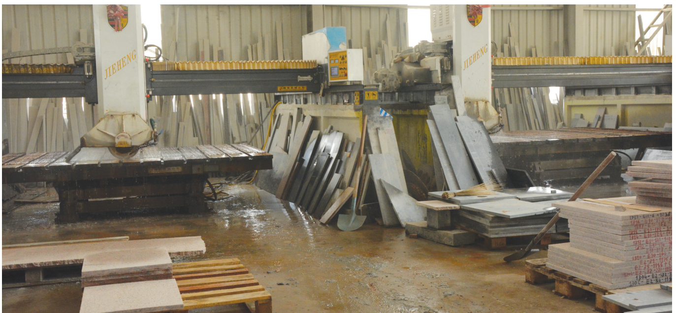
Inside the production factory