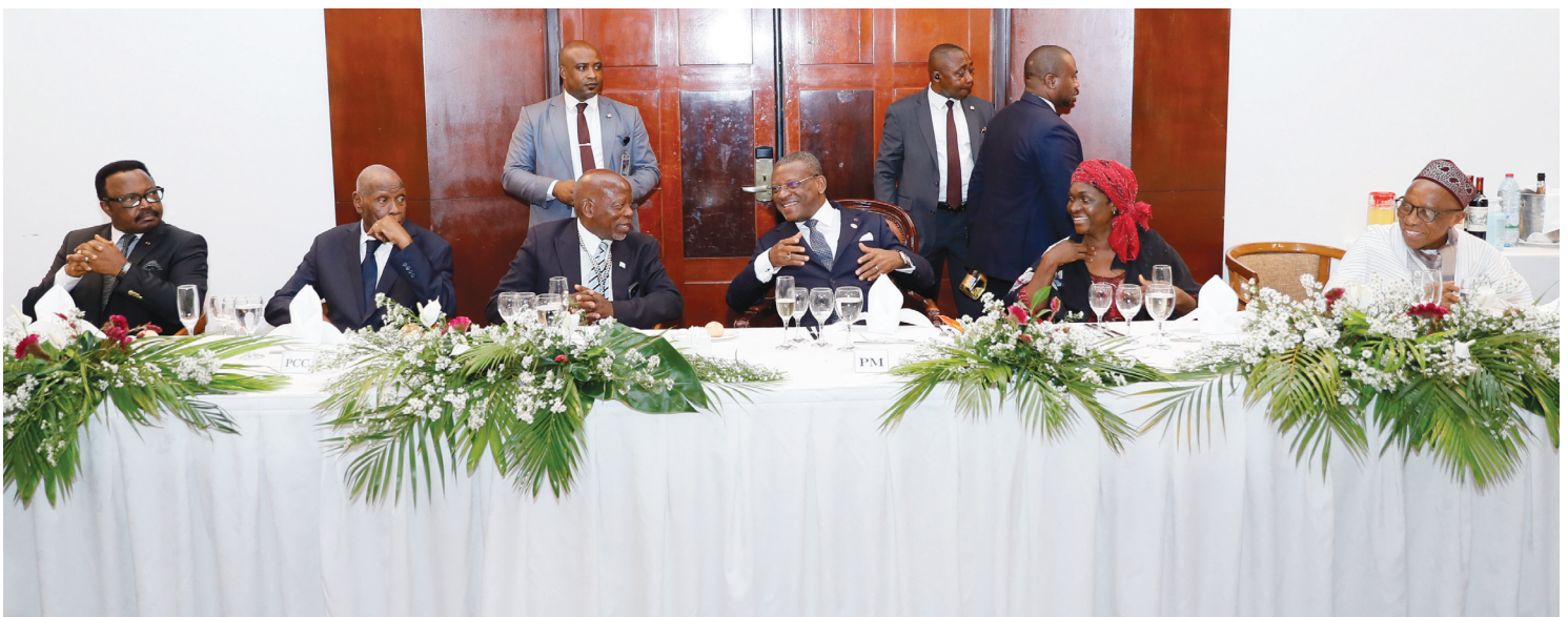
The Prime Minister (middle) at a convivial evening with delegates yesterday