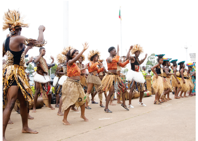
Some dance groups were present

The atmosphere around the Yaounde Conference Centre, venue of the event which has brought together parliamentary leaders from all the 21 Commonwealth nations in Africa, was electric. The ambiance was also telling of the magnitude of the event and the calibre of guests attending it.