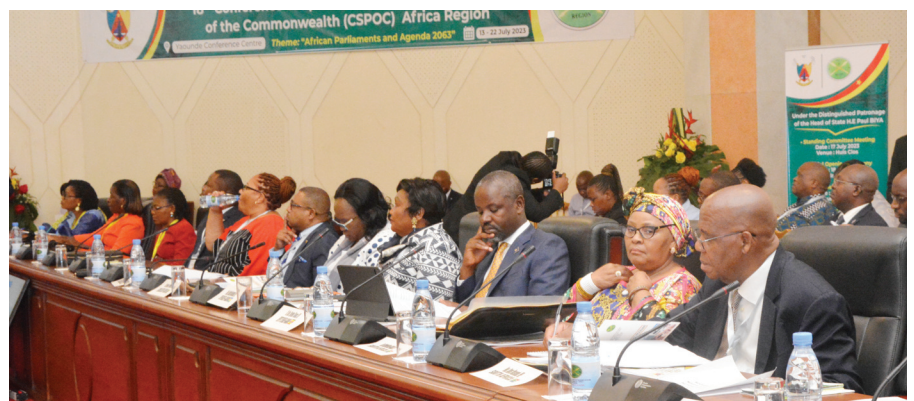
Participants reflect on Africa's climate change problems

The Rt. Hon. Chisangano Malungo of Zambia said her parliament launched