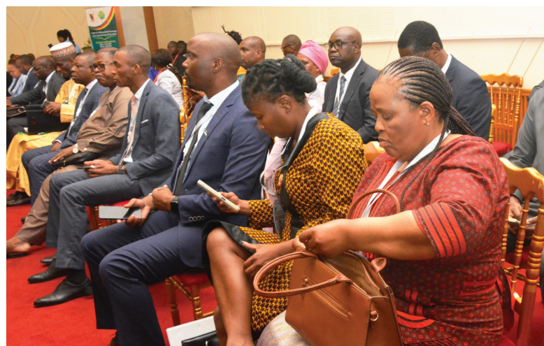
Full participation during plenary