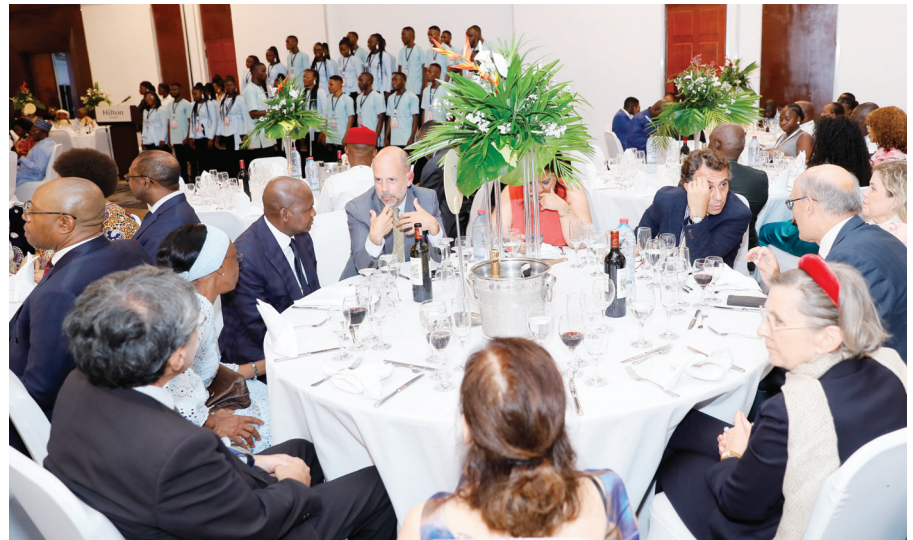
Delegates waiting to have a taste of Cameroonian cuisine while the Buea University Choir animates at the background

Speaking to Delegates, Members of the Diplomatic Corp and some members of Government and invitees present, the Prime Minister said the dinner is a celebration of the excellent cooperation that exists between the Commonwealth and our respective countries particularly in promoting the socio-economic development of our peoples. He expressed hope that mutually beneficial collaboration would continue and intensify. And that deliberations would lead to appropriate solutions for an effective and efficient implementation of agenda 2063. Offering a toast, he invited the delegates to use the event and discover the rich cultural specificities and culinary arts which have earned Cameroon the name, “Africa in miniature”. The evening was spiced by renowned artists and rich cultural dances from the four main cultural zones of Cameroon. On the menu were a variety of Cameroonian dishes like “khati khati” made of corn flour and vegetables accompanied by roast chicken; “ndole”, made from a specie of bitter vegetables and groundnut paste, which could be eaten with either yam, plantains, or “miondo”, made from fermented cassava paste. There was also “okra soup” among others.