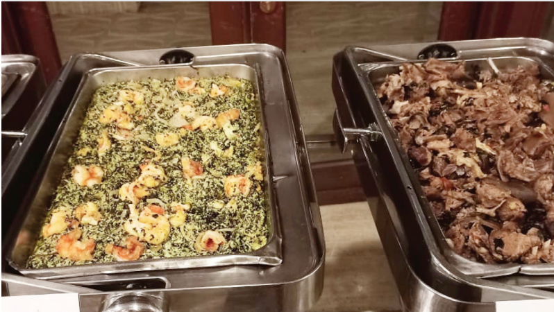
Ndole with shrimps