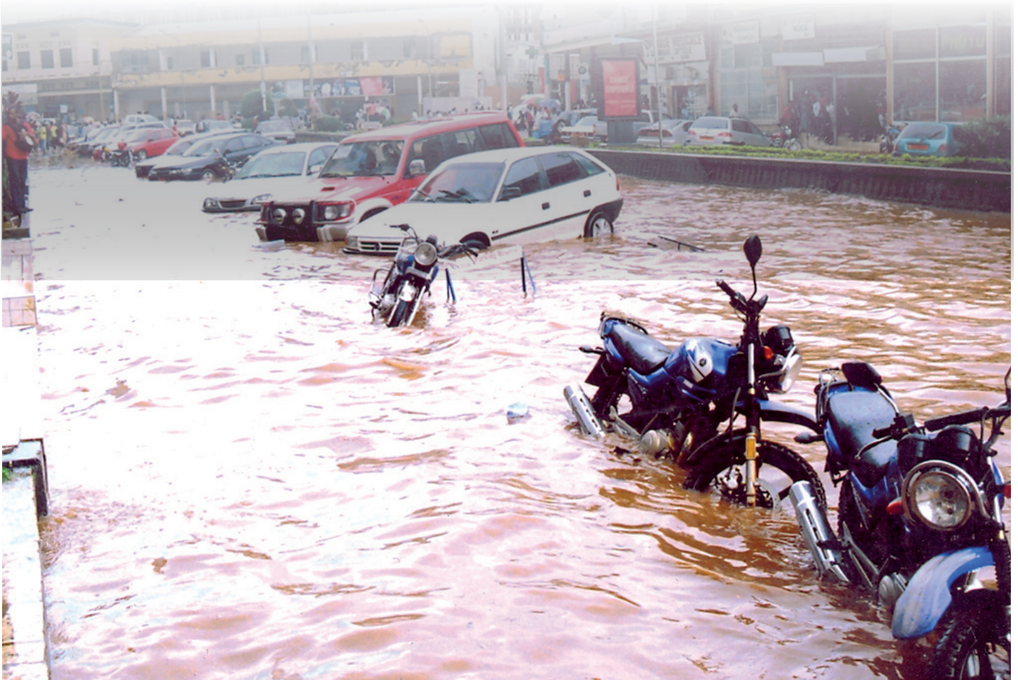
Floods are some of the consequences of climate change

P lenary sessions of the ongoing 18th Conference of the Speakers and Presiding Officers of the Commonwealth, (Africa Region) unfolded yesterday July 19, 2023 at the Yaounde Conference Centre with delegates examining climate change issues and their ravaging effects. The motion, moved by